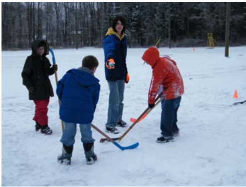
Get an early jump on the fun!